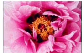
2004 Macro Class

Additional information is available on-line at www.psnwa.org . For more information email photosociety@psnwa.org .