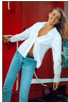
by John Baltz

Take a look at these two images. One is posed against a brightly lit sky. It offers no background and the lighter area of the sky just distracts from the image. Now with just a simple changing of the pose, the image is even and the subject becomes more pronounced.