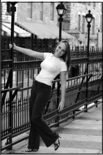
by Patrick Ward 2004 Symposium

Now I know what is going through the minds of many PSNWA members. It is a symposium concentrating on fashion and fine art, and you may be more interested in nature or journalism. All I can say is that the lighting and photographic techniques you learn during the symposium will help you in whatever future photographic endeavours you may have. Plus, never be afraid to broaden your horizons, the more you learn the better your understanding of photography as a whole and the better you will be for the knowledge.