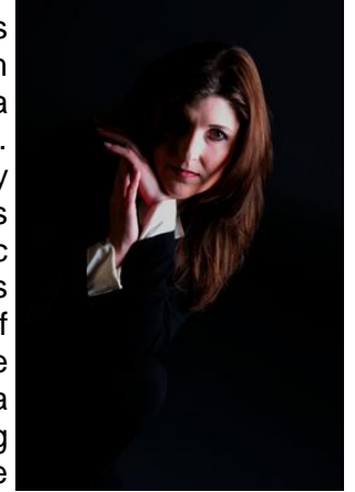
Low Key Class