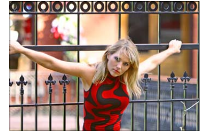
by Patrick Ward 2004 Symposium

Four rooms have been rented in the historic Basin Park Hotel for use during the Symposium. Attached to the 855 square foot Atrium used for registration is the Grand Ballroom that will house the Symposium's two studios. The studios are equipped with five large watt strobes fired by a wireless radio slave system. Cameras with a standard PC jack or even just a flash hot-shoe will be able to fire the lighting system. In addition to the professional lights the studio has all the necessary accessories including: multiple backgrounds, and interesting props.