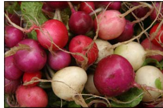
2004 Macro Class