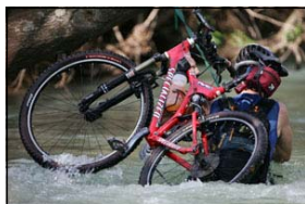
by Patrick Ward

For the past 5 years I have led a team of PSNWA photographers to capture the emotions, pain, defeat and victory of the amazing Ozark Challenge Eco racers. During the race teams of 4 test their skills of navigation, climbing, mountain-biking, rappelling, canoeing and sheer Stamina!