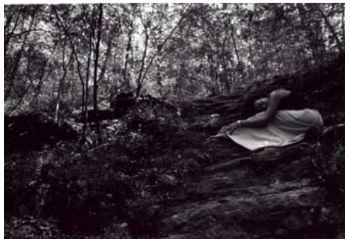
Tara Cole - Fine Art