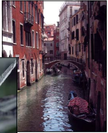
Jim Salmon - Architecture