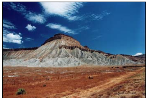
Blake Fougousse - Landscape