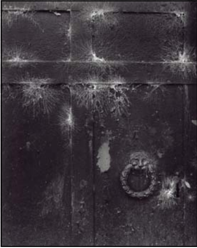
Scott Oestreich - Black White